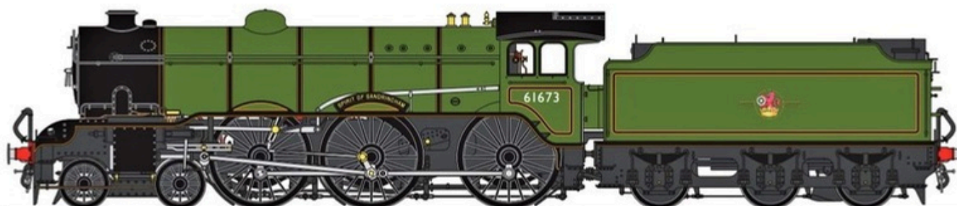
B17 CLASS LOCOMOTIVE NEW BUILD 61673 'SPIRIT OF SANDRINGHAM'

The Trust had an open day last Saturday and the cab was taken there for viewing. It will return here soon to be finished. Next, they'll be working on the splashers, can doors and steps. A great project to have here at Quanton!