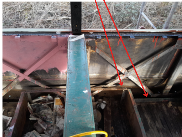
Seating area under the window. Note the girders and hidden areas behind them