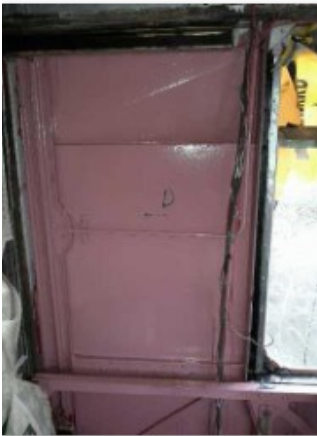
Left hand side door pocket